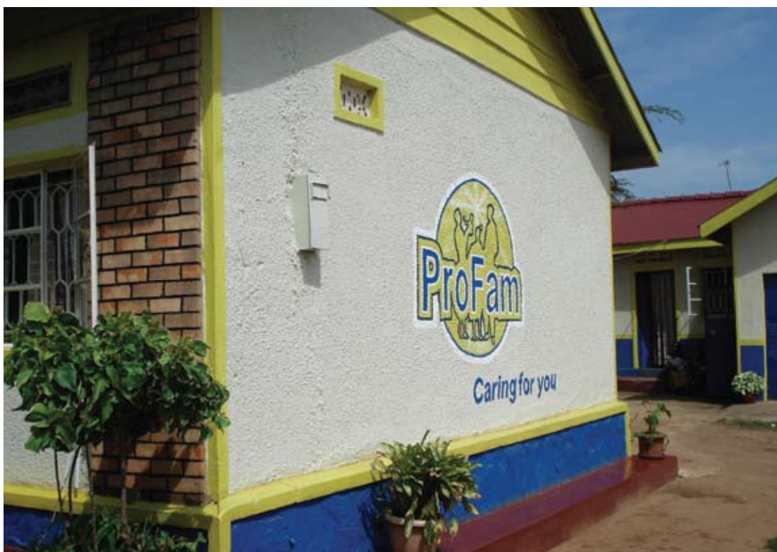
A ProFam clinic outside Entebbe offers safe delivery and reproductive health services, including misoprostol, oxytocin and MVAs.

on life-saving skills for newborns, newborn and child immunization and growth monitoring.