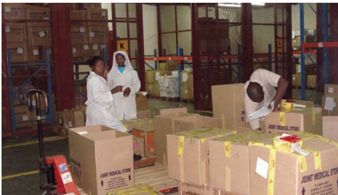
Staff prepare orders at the Joint Medical Store warehouse in Kampala.

transferred from the Ministry of Health to NMS. Previously, facilities held their own budgets for equipment and supplies. In Fiscal Year 2009-2010, 70 percent of the budgets were transferred to NMS, with a 100 percent transfer planned for the fiscal year beginning in July 2010. The advantage of the new system, according to government officials, is that it will allow NMS to be paid in advance of procurement, avoiding previous problems with delayed payments by districts. NMS officials were also concerned that many government facilities were directing their business elsewhere, and cite problems with corruption and waste in the ordering process at lower levels. However, some providers express concern that this policy will not allow facilities to use JMS as a backup source of supplies if NMS is unable to fulfill orders, because facilities will have no other source of funding. According to one donor, the transfer of funding from MOH to NMS will solve financing delays, but planning and quantification of need for supplies could still be weak. 86