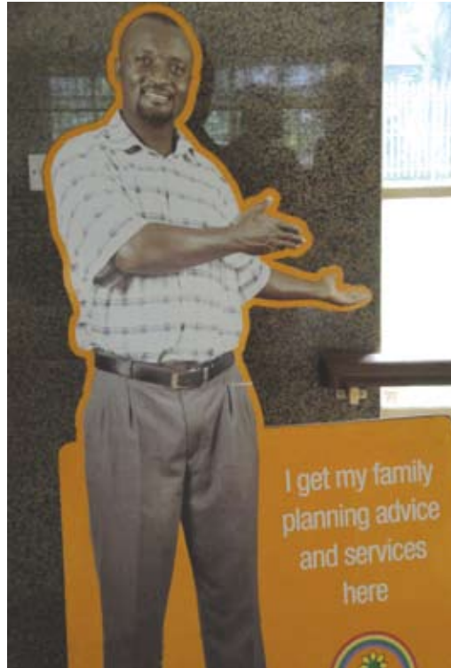
An advertisement in the Ministry of Health promotes family planning.

There is a strong need to increase access to family planning to some of the most vulnerable by increasing the provision of youth-friendly services. 140 In many cases, adolescent and teen-age girls in Uganda become mothers earlier than planned through unintended pregnancies. Without family planning services and supplies, they become in need of maternal, newborn and child health services across the continuum of care—while facing the associated increased risks of pregnancy and childbirth at young ages.