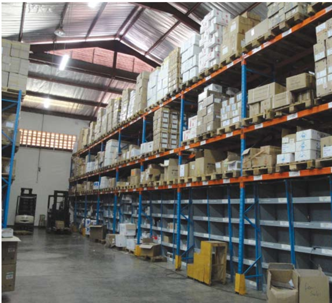
The Joint Medical Store warehouse houses an array of products to be packaged into clients' orders.

collaborators in the health sector. Private nonprofit organizations face many of the same challenges that burden the country's public sector health system; yet, the private sector is widely perceived as being a more reliable source of supplies than government facilities. Unlike government institutions, private facilities typically charge official user fees for their services, often a flat fee that includes costs for all associated supplies. In the private nonprofit sector, the supply chain is described as well-functioning, because facilities are able to order drugs based on their needs and on their own timeline from the Joint Medical Store (JMS). However, due to its faith-based orientation, JMS does not supply misoprostol, MVAs or contraceptives.