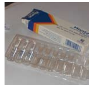
Maternal health supplies available at a private sector clinic include misoprostol, oxytocin and ergometrine.

Some maternal health supplies, including oxytocin and misoprostol, are available for purchase on the private market. One ampule of oxytocin costs 400 to 600 shillings ($0.20 to $0.30) in local pharmacies. Some providers report that one tablet of misoprostol costs 500 shillings ($0.25), with three to five tablets required per dose, while others report a higher price.