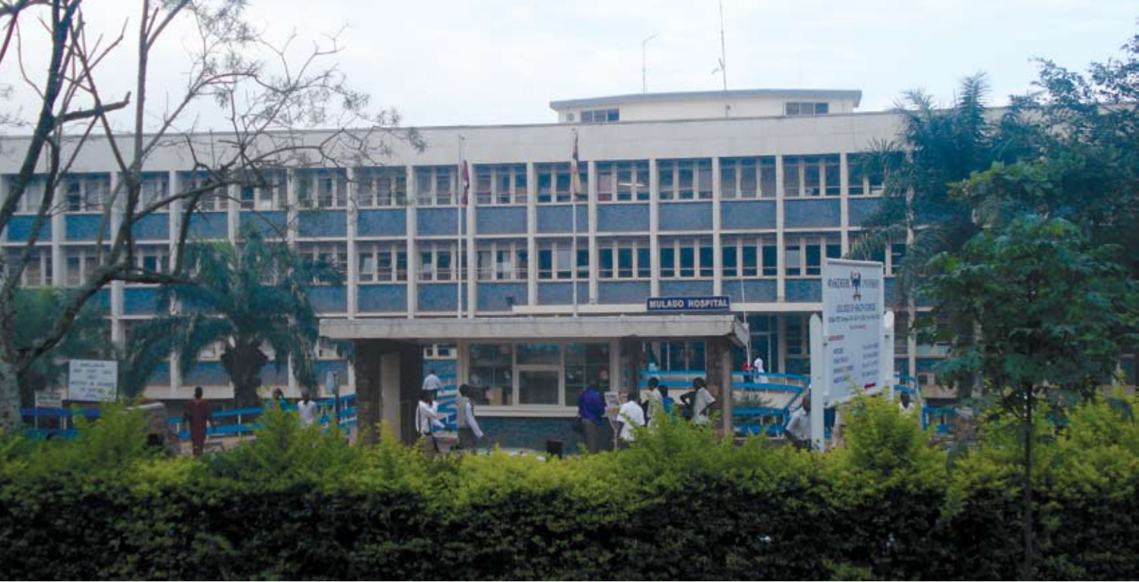
Supplies are stored at a Health Center IV in Kampala.

of decentralization is good, lack of capacity and resources, and lack of genuine community mobilization and participation have undermined its virtues in Uganda. There is also evidence to suggest that health core financial resources... do not reach HC III and community levels in sufficient amounts and sometimes these funds reach late.” 36