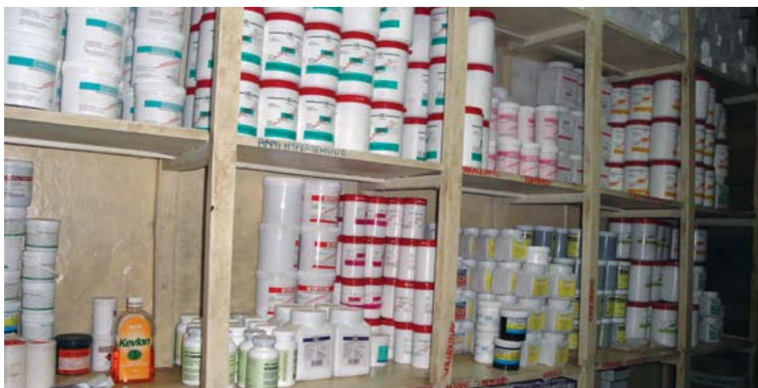
Supplies are stored at a Health Center IV in Kampala.

A representative Health Center IV in Kampala visited during the research of this case study